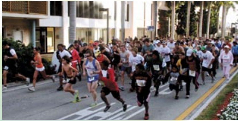
Off and running!

Participants received t-shirts, food and refreshments. The top finishers received plaques. Much thanks to the many volunteers and sponsors who made the event a great success!