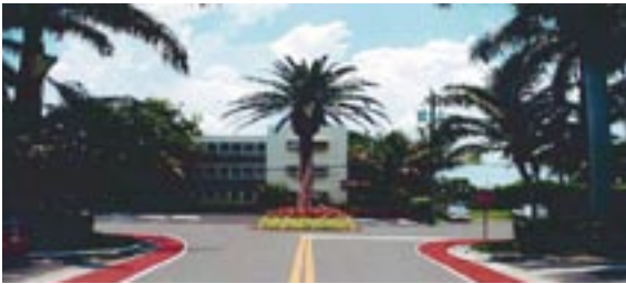
Proposed rendering of the intersection of 99th Street and W. Bay Harbor Dr.

The East Island Community Enhancement Project will include new streets, curbs, gutters, lighting fixtures, hurricane resistant overhead power lines, walking paths and additional landscaping. Once completed, our Town will be not only be beautiful, but will have a solid new foundation.